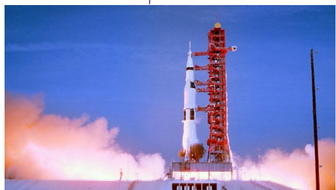
Apollo 11 was the American spaceflight that first landed humans on the Moon on July 20<sup>th</sup> 1969.