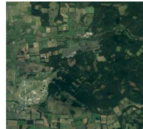
Aerial Map of Brandon