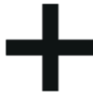
place of worship