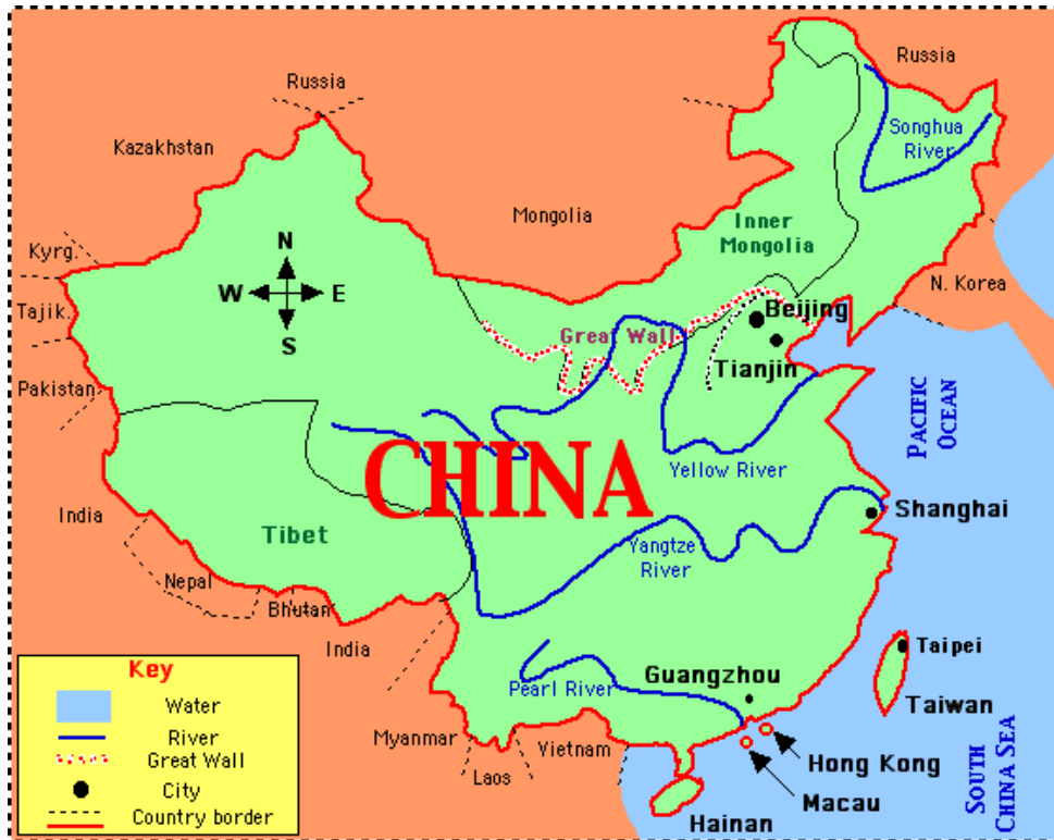
Map of China