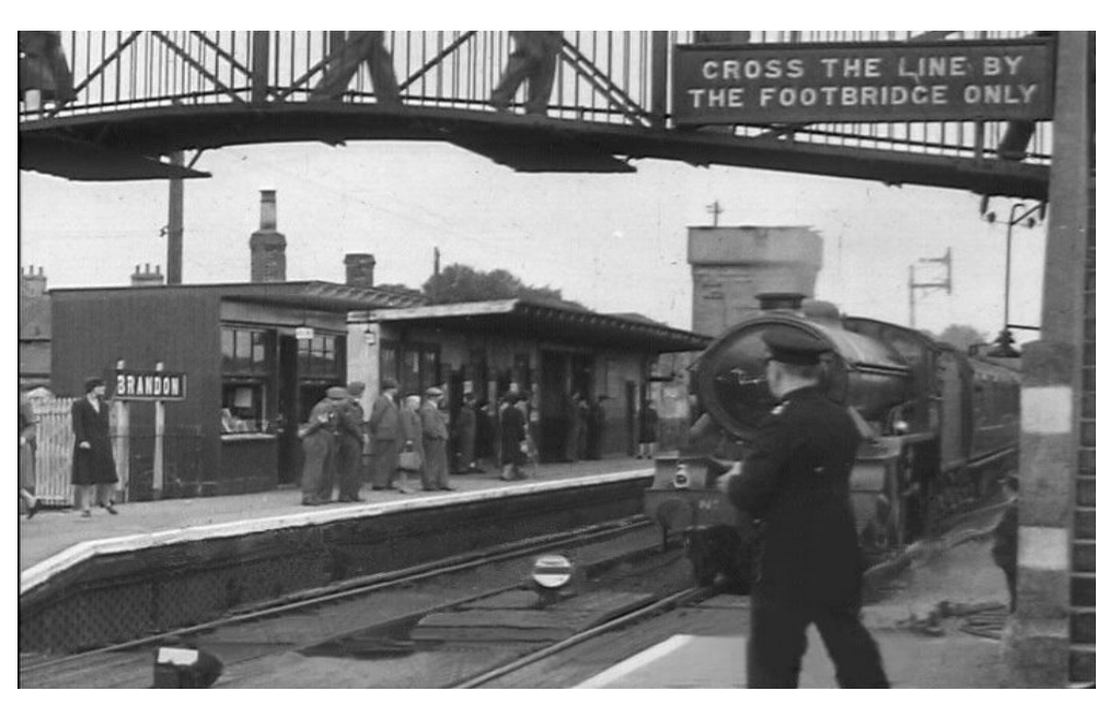
Royal Visit - Brandon Station in 1945