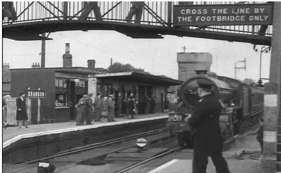
Royal Visit – Brandon Station in 1945